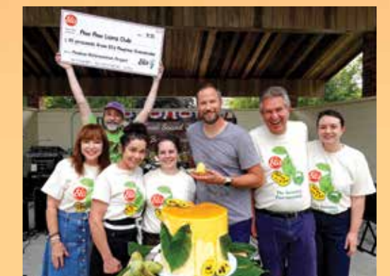
Pawpaw Fest 2025. All festival proceeds were donated to the Lions Club Pawpaw Reforestation Project.