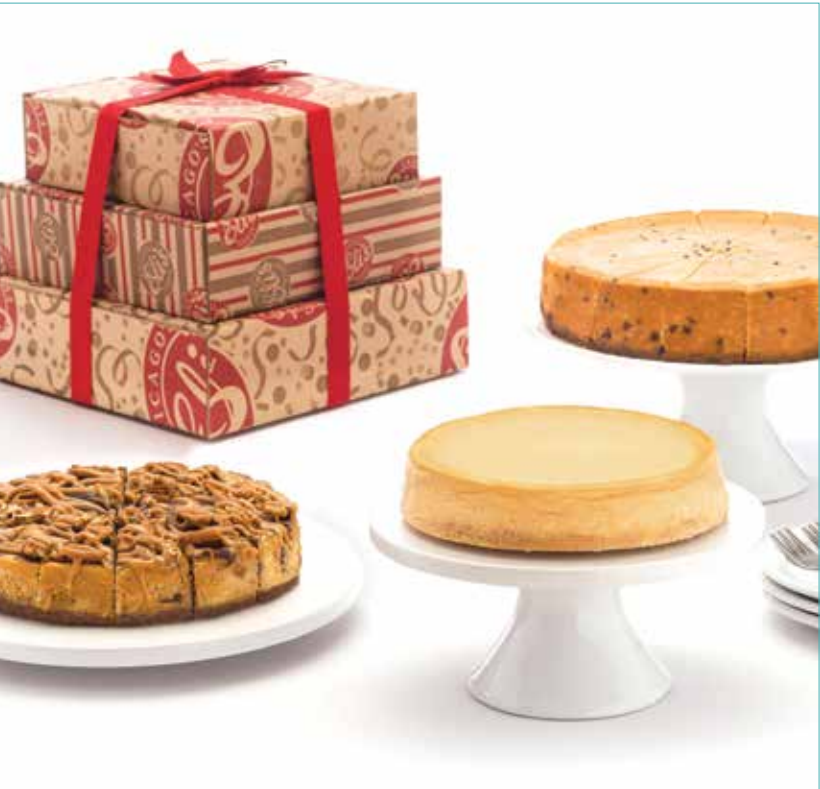
ORIGINAL CHEESECAKE TOWER Receive one 7" Original Plain Cheesecake, one 8" Turtle Cheesecake and one 9" Chocolate Chip Cheesecake. Arrives in our custom gold and red gift boxes tied with a red ribbon, ready for gift giving. $110 Serves 40