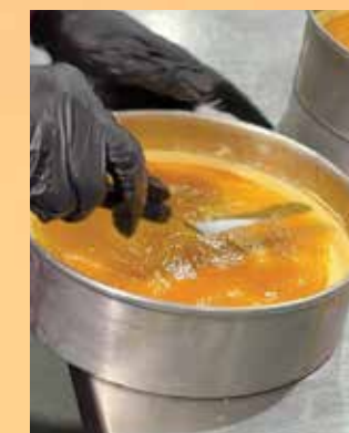
Applying pawpaw gelee