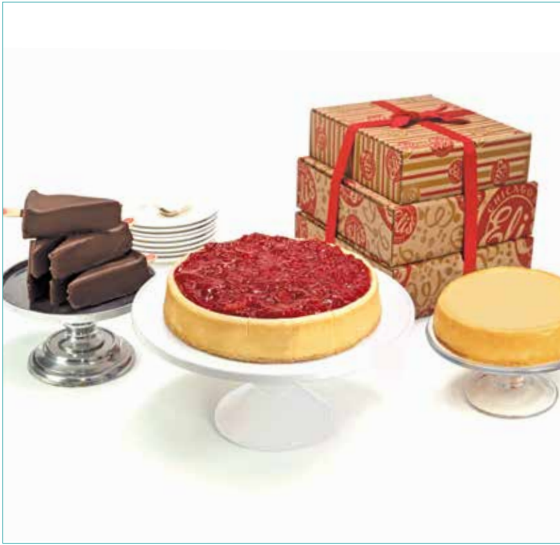
BEST OF ELI'S TOWER When your gift calls for the best of everything Eli's, this is it! One 7" Original Plain Cheesecake, one 9" Strawberry-topped Cheesecake, and six Cheesecake Dippers®, frozen cheesecake dipped in chocolate, served on a stick. $105 Serves 34