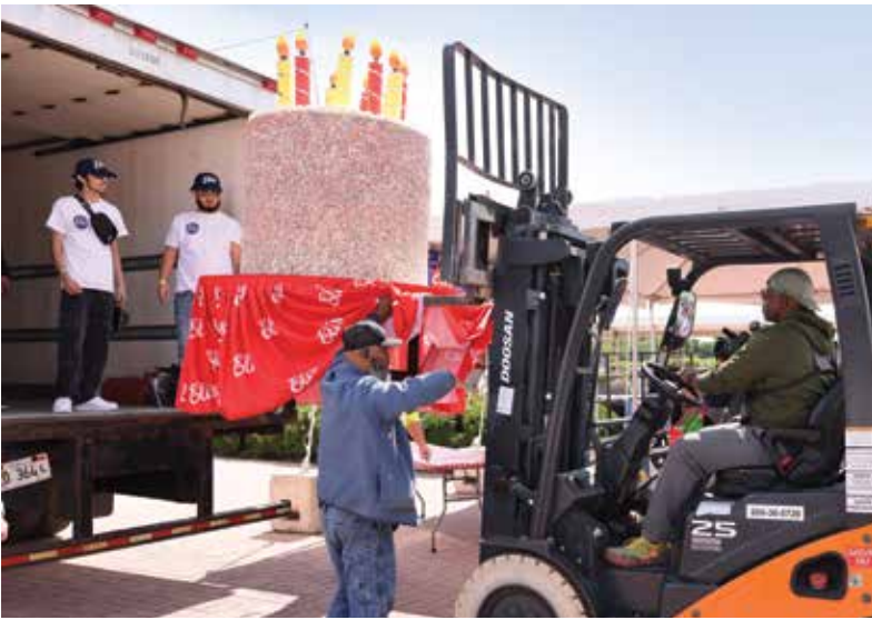
Forget the fork! We needed a forklift to move our 1,000 lb. birthday cheesecake from the truck to the Big Cake tent at Taste of Chicago.