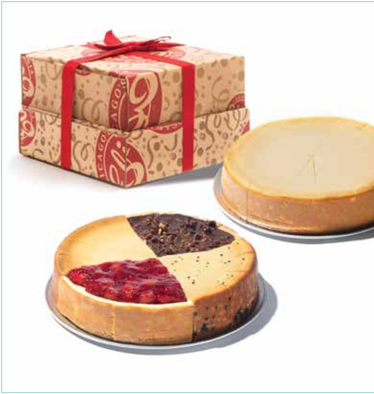
PARTY GIFT PACK Celebrate with two cakes, shipped in one box! Includes a 9" Original Plain Cheesecake and a 9" Original Sampler (for details, see page 16). $95 Serves 32