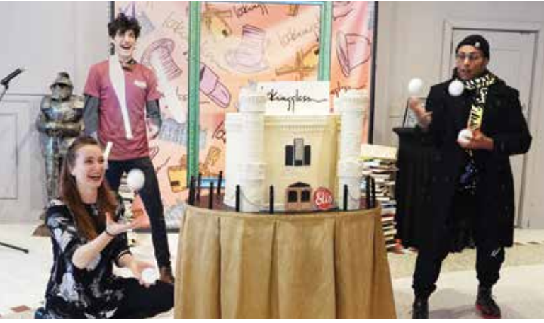
Happy 37th birthday, Lookingglass! Juggling cast members entertained the crowd before cutting the giant cheesecake, inspired by the theatre's story castle home, the historic Water Tower Water Works.