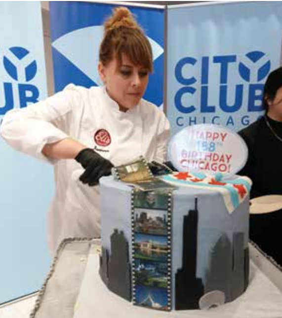
Happy 188th birthday Chicago! The 200 lb. cheesecake was decorated with an edible film strip of Chicago landmarks, served free to the public.