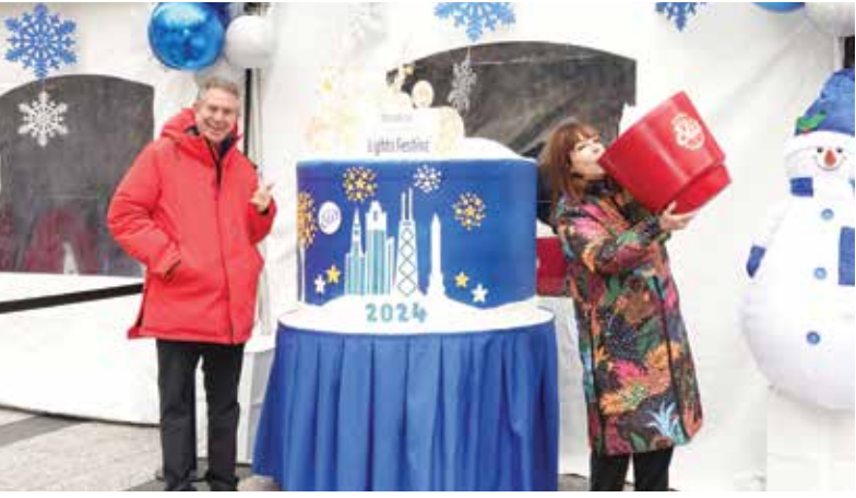
Nothing goes better with The Wintrust Magnificent Mile Lights Festival cake than a super sized cup of cocoa.