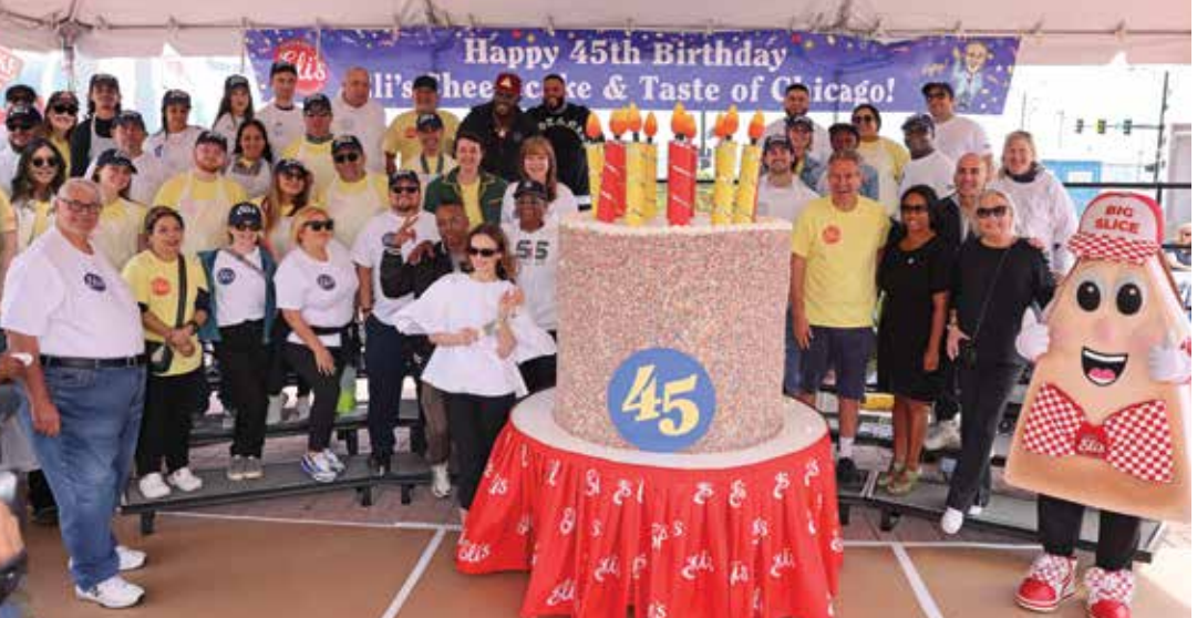
Thanks, Eli's Team...it takes a village to make a 1,000 lb. cheesecake!