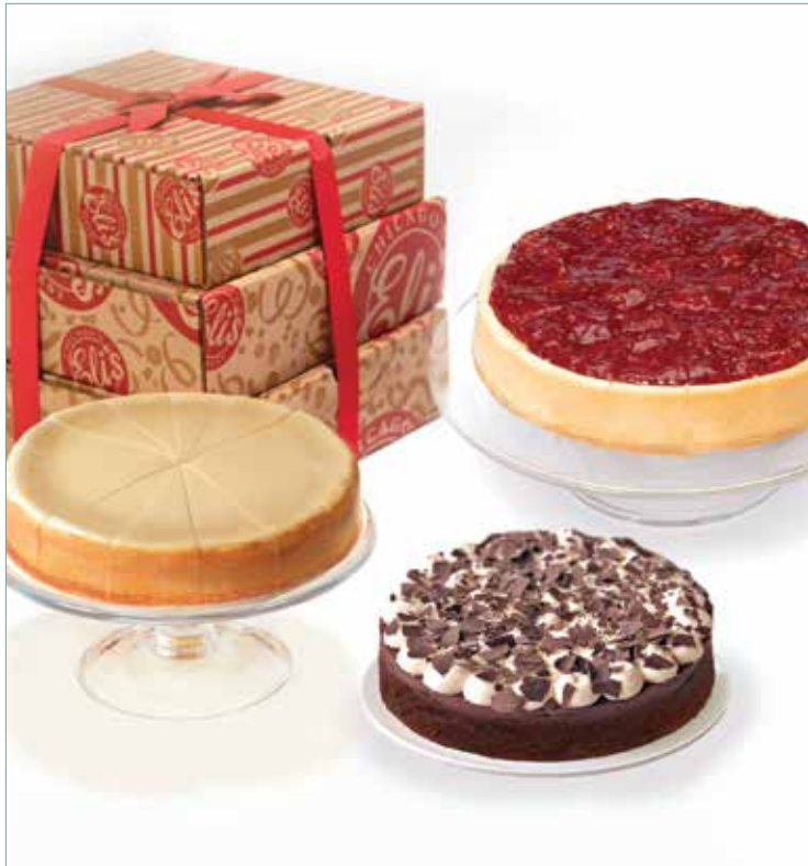
NEAPOLITAN CHEESECAKE TOWER One 7" French Silk Cheesecake, one 8" Original Plain Cheesecake, and one 9" Strawberry-topped Cheesecake, arrive stacked in our custom gold and red gift boxes tied with a red ribbon, ready for gift giving. $110 Serves 40