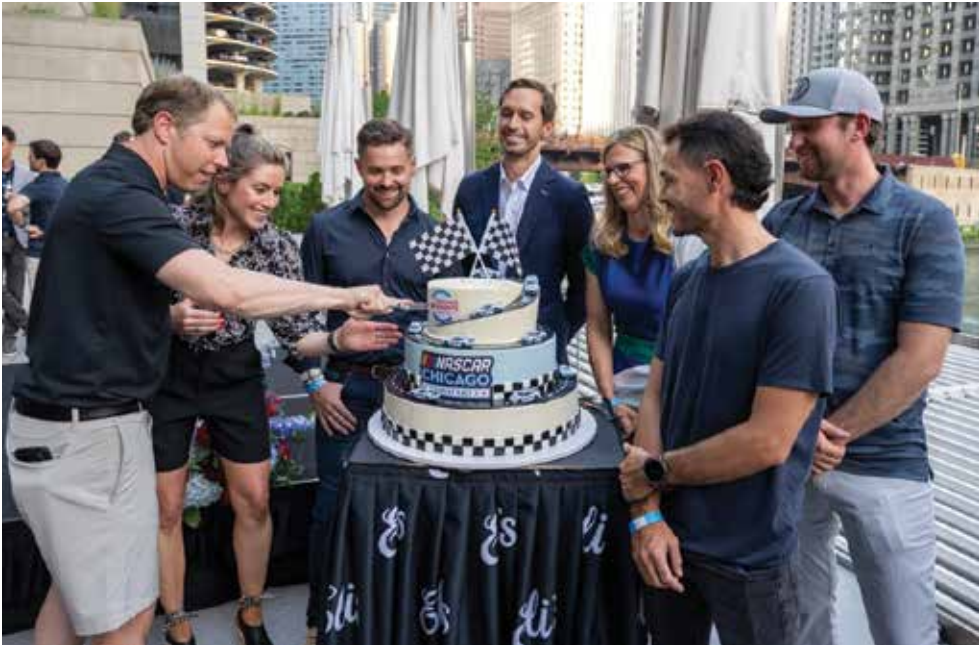
Drivers start your engines and raise your forks! Here's our giant cake celebrating the NASCAR Chicago Street Race, complete with a track and model race cars.