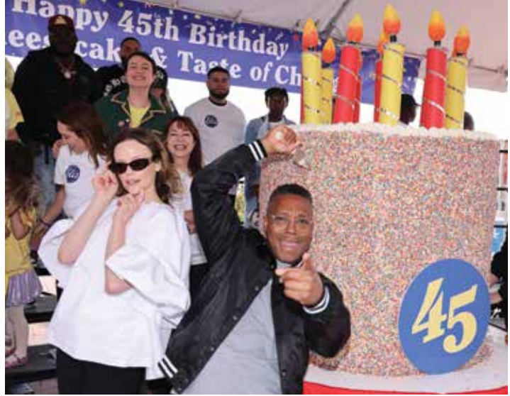
After Grammy-winning rapper Lupe Fiasco and actress Sarah Ramos ( Chicago Med and The Bear ) cut the cake, we served it free to the public!